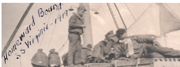
The USS Virginian was commissioned from February 1 to August 19, 2019, for troop transport. After four voyages between France and the U.S., she was decommissioned and converted back into a civilian cargo ship.

On November 11, 1918, the announcement of the armistice was front page news. Though it would take as long as two years before the troops were fully demobilized, ships carrying war-weary soldiers soon began crossing the Atlantic and most were home within a few months.