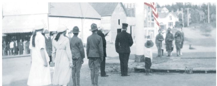
"For months a number of public-spirited citizens had been soliciting funds for the purchase and erection of a community flagpole and for a large flag.... On May thirtieth [2017]...the flag was raised.... The flagstaff was as tall and straight a spar as I had ever seen, painted white and slimmer at the base than one would have expected for the great height. Large and jagged fragments of igneous rock had been chipped off some island buttress and placed a fitting guard around the pole's base." (Underpinning, by Caroline Reed)

In a nation unprepared for war, islanders found themselves seeking ways to express their patriotism through flag waving and volunteering.