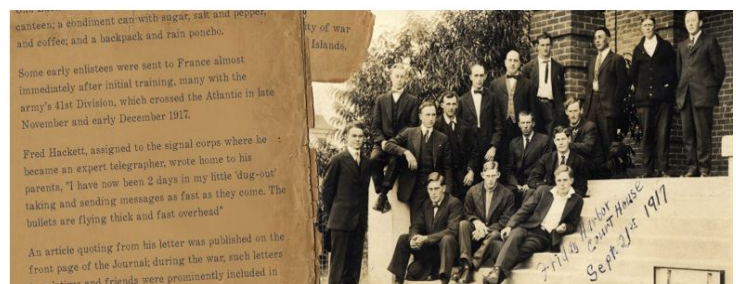
Servicemen meet at San Juan County Courthouse before leaving for duty.

On April 6, 1917, the U.S. joined allies Britain, France, and Russia to fight in World War I. Tiny San Juan County, with only 3,600 residents on its small scattered islands, had 124 servicemen enlisted. These brave country boys served in almost all branches of the military: The Army, Navy, Coast Guard, Marine Corps, Merchant Marine, and fledgling Air Service. Some did duty in the United States, others in places as diverse as France, Cuba, the West Indies, and Alaskan waters.